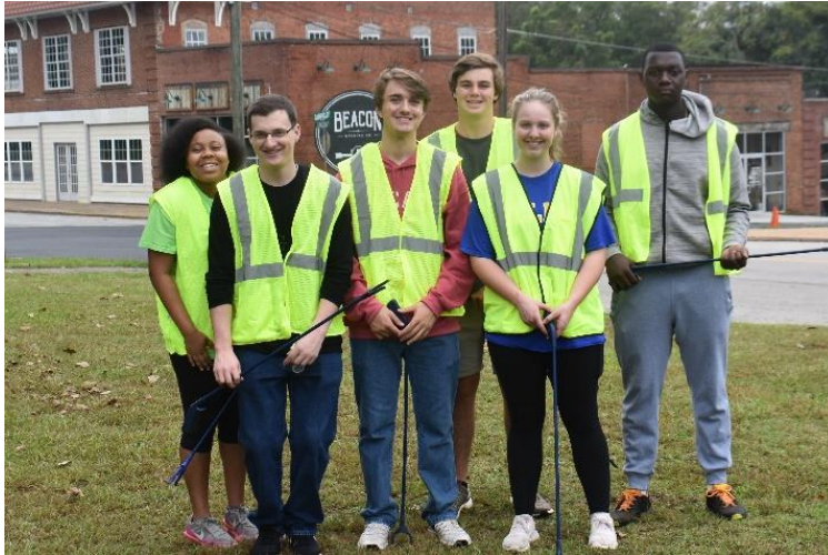
LLBTWI October 2018 event with LaGrange Youth Council members

On Friday, April 26 th , area businesses and the community are invited to join city employees in the litter pick-up event. After cleaning up the community, there will be lunch served on Lafayette Square in downtown LaGrange.