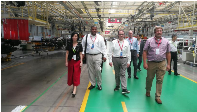
City leaders touring a Chinese industry in Liuzhou