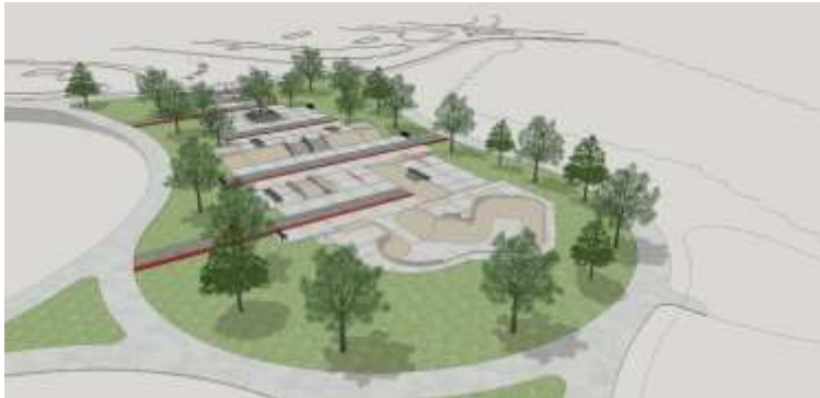
City of LaGrange Skate Plaza

including his own Tony Hawk Foundation that helps to build skate parks in underprivileged areas.